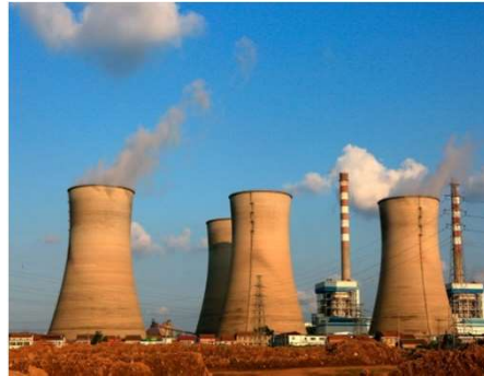
245 MW Captive Power Plant in Chhattisgarh