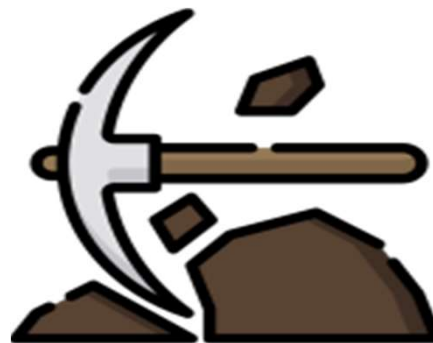
Strategically located in major mineral belt of the Country