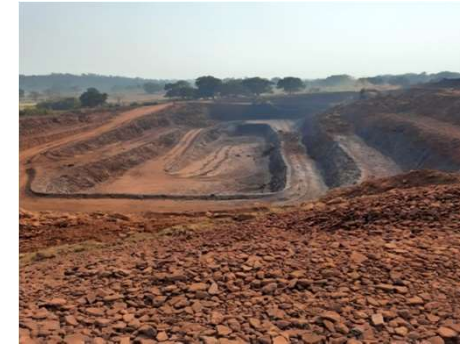
Captive Iron Ore Mine in Odisha