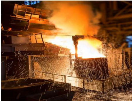
1.2 Mn TPA Integrated Steel Plant in Chhattisgarh