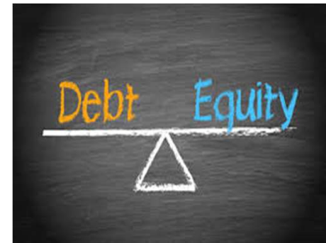
One of the lowest leveraged Company in the industry