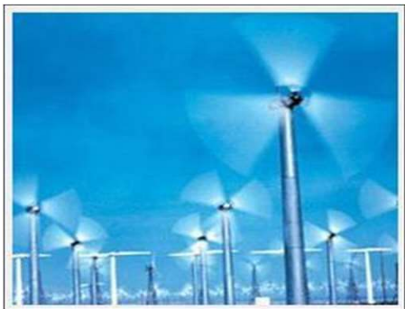
6 MW Windmill unit at Tamil Nadu