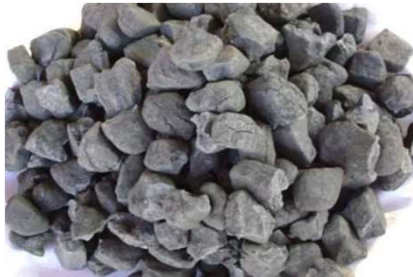
SPONGE IRON DRI